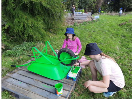
Upcycling: A 'garden barrow'