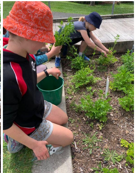
Herb garden being tidied up