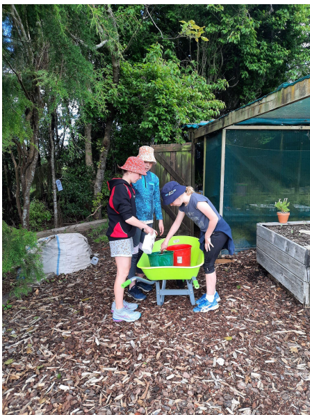
Seaweed fertiliser being prepared