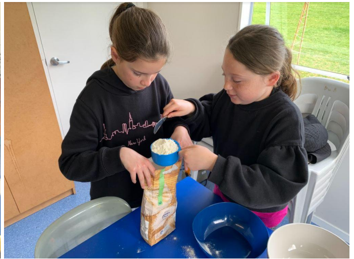
Flatbread being prepared