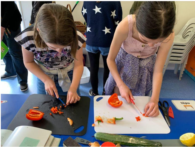
Skilled knife cutting