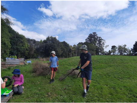
Removal of cut trees

Room 1 learners started their journey with Garden to Table on Wednesday 20th October. WOW! They were AMAZING! Keen, enthusiastic and ready to learn whether in the kitchen or the garden. So much mahi. So much effort. So much enthusiasm!