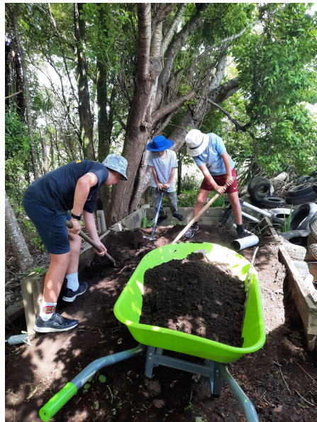
Rich soil being moved