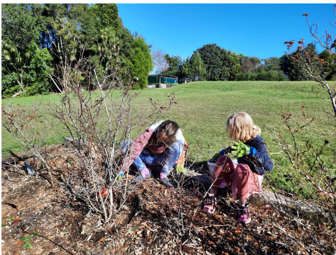
Lauren & Isabelle: coffee grinds for the blueberries