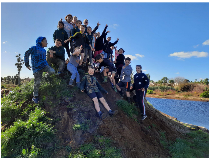
Who can go past a mound of dirt to climb? Not us 😊