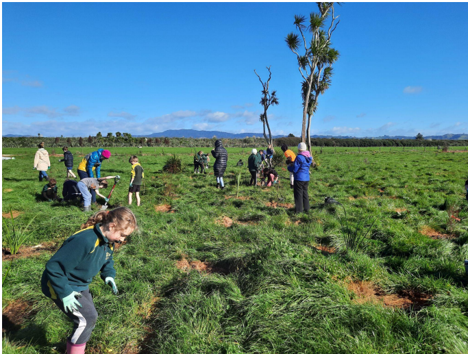
150 trees planted by our learners - go team!