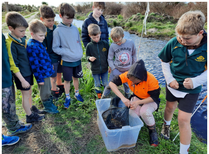
In anticipation of eels being released.